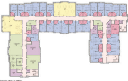
First Floor Plan | Bedrooms - 28 | G.I.A. - 1486m 2