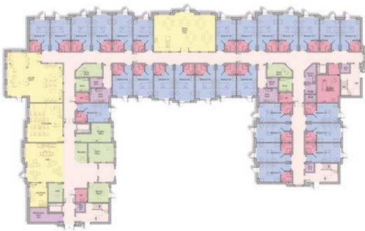
Ground Floor Plan | Bedrooms - 28 | G.I.A. - 1486m 2