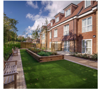
Some recent Care UK care homes.