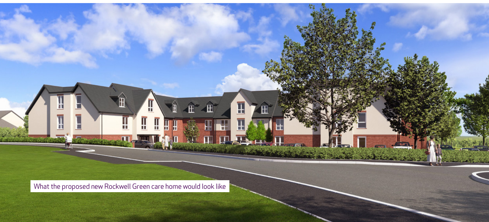
What the proposed new Rockwell Green care home would look like