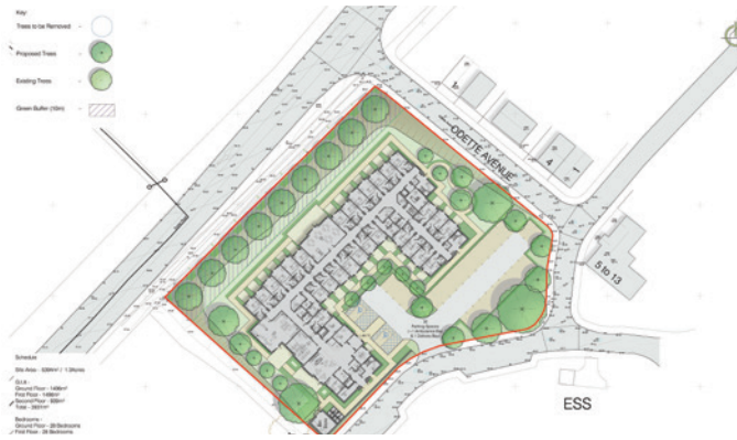
Proposed site plan